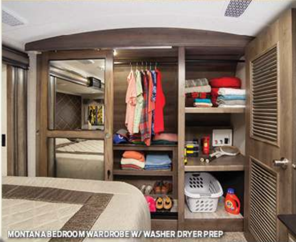
MONTANA BEDROOM WARDROBE W/ WASHER DRYER PREP