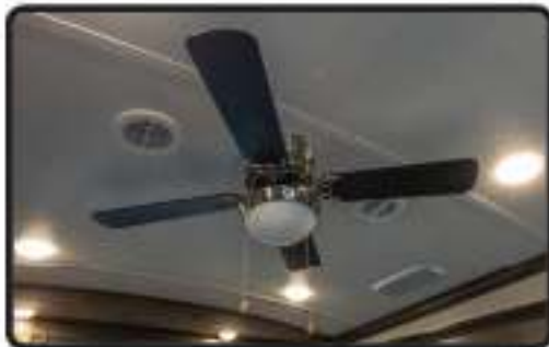
RESIDENTIAL CEILING FAN PROVIDING NATURAL AIR MOVEMENT