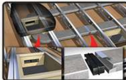
DUAL 15K QUIET COOL AIR CONDITIONING SYSTEM WITH SUPERCHARGED DUCTING