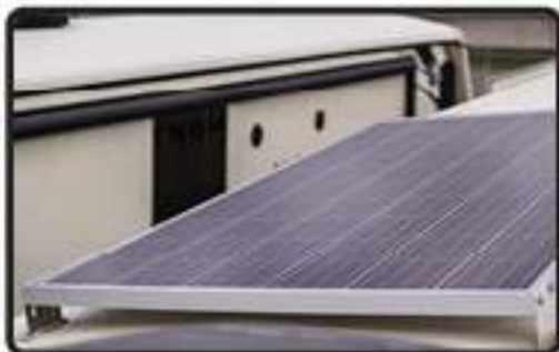
ROOF SOLAR PREP ALLOWING YOU TO ADD THE SOLAR PANELS WITH EASE