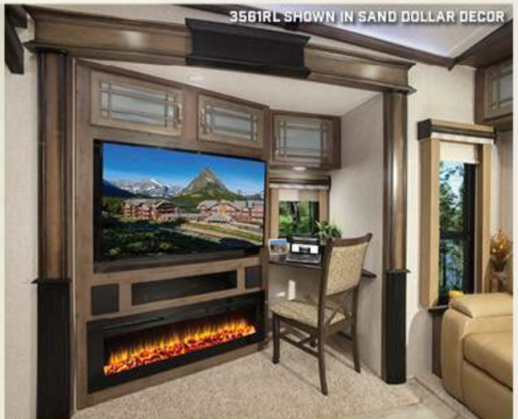
35B1RL SHOWN IN SAND DOLLAR DECOR