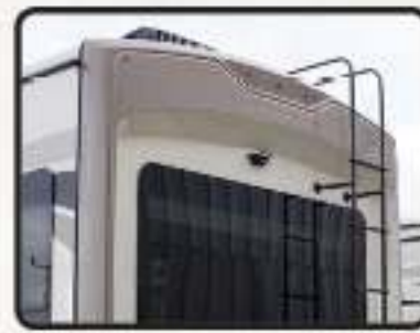
DECORATIVE FIBERGLASS REAR CAP (N/A 3700, 3701, 3790, 3791)