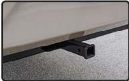
2" RECEIVER HITCH WITH 300 LB CAPACITY FOR YOUR ACCESSORIES