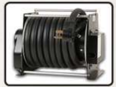
SHORELINE POWER CORD REEL (N/A 3130RE)