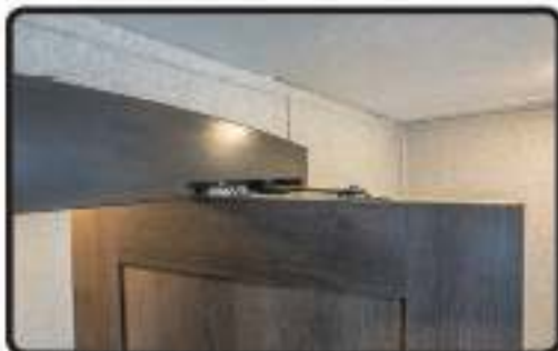
PIVOT HINGE BATHROOM DOOR ALLOWING PASSAGE WHILE DOOR IS OPEN