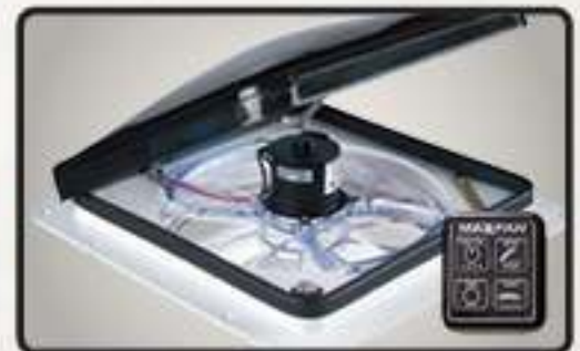
KITCHEN AND BATHROOM POWER RAIN SENSOR VENT FAN WITH MULTI SPEED WALL CONTROL