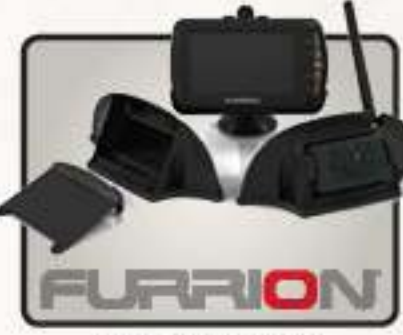
WIRELESS REAR VIEW CAMERA SYSTEM