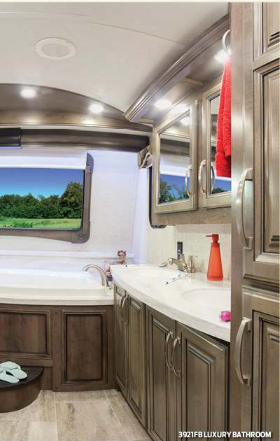
3921FB LUXURY BATHROOM