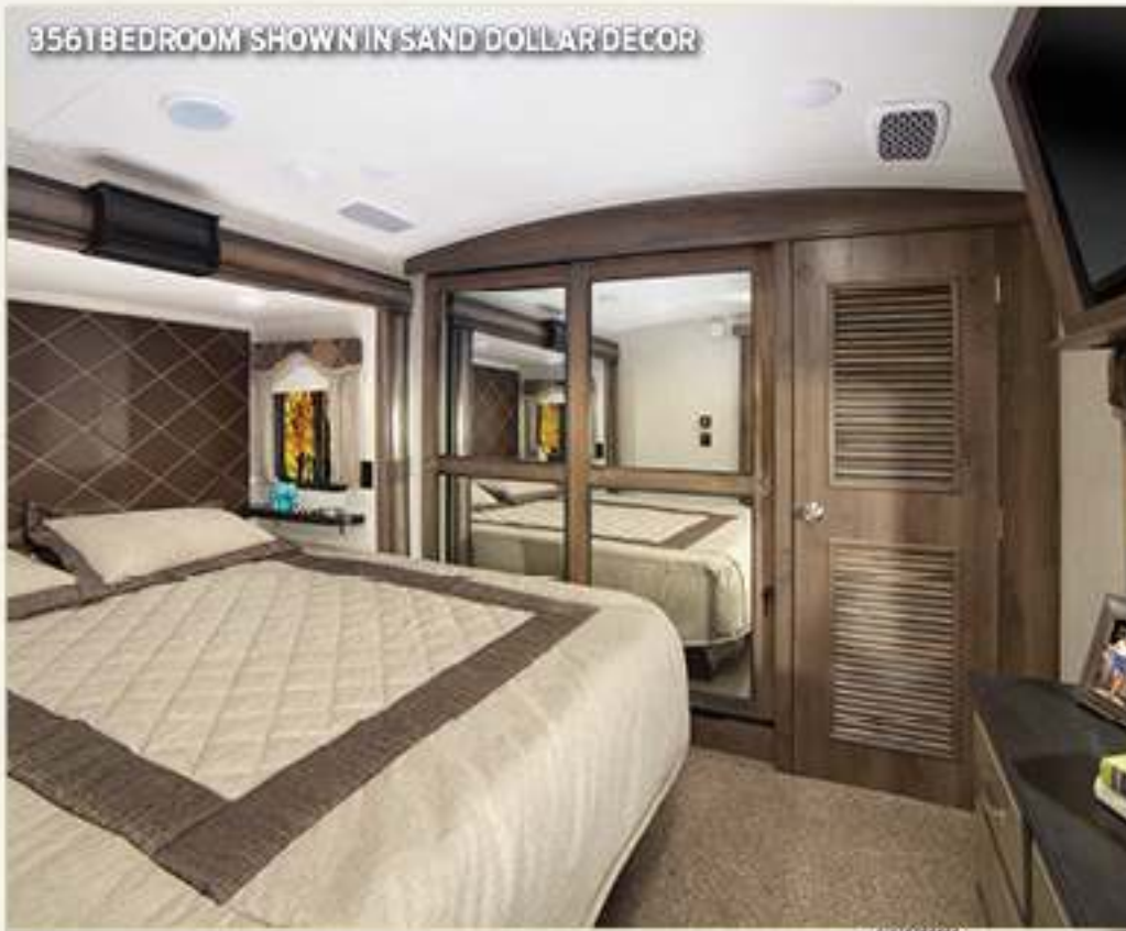
3561BEDROOM SHOWN IN SAND DOLLAR DECOR