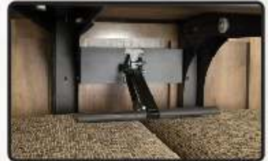
CHAIR BUDDY ALLOWING YOU TO EASILY SECURE YOUR CHAIRS FOR TRAVEL