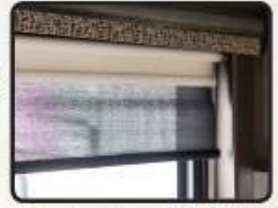
UPGRADE DAY/NIGHT ROLLER SHADES (LIVING ROOM ONLY)