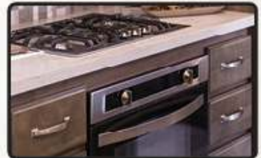
FURRION OVEN AND COOKTOP FOR BETTER COOKING RESULTS