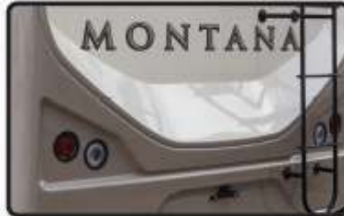
BACKUP LIGHTS PROVIDING ADDITIONAL SAFETY AND SECURITY