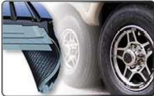
6 RANGE TIRES AND DEXTER AXLES WITH NEV-R-ADJUST BRAKES