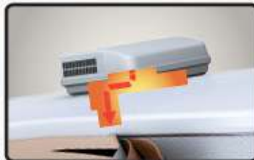
HEAT PUMP MAIN A/C PROVIDING HEAT WITHOUT BURNING YOUR LPG