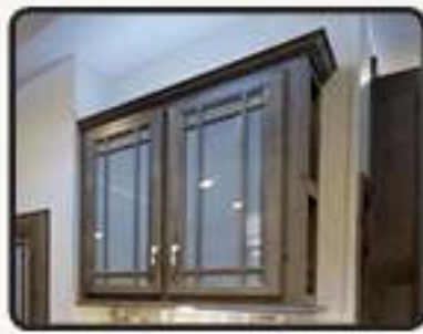
HARDWOOD CHERRY CABINET FRAMING (STILES)