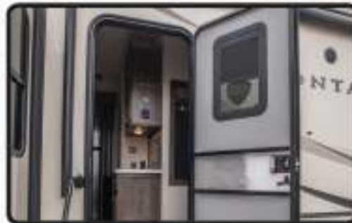
78" TALL ENTRY DOOR WITH INTEGRATED WINDOW SHADE