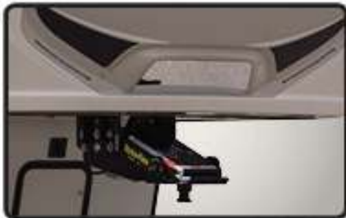
PATENTED HITCH VISION MIRROR TO ASSIST IN YOUR HITCH CONNECTION