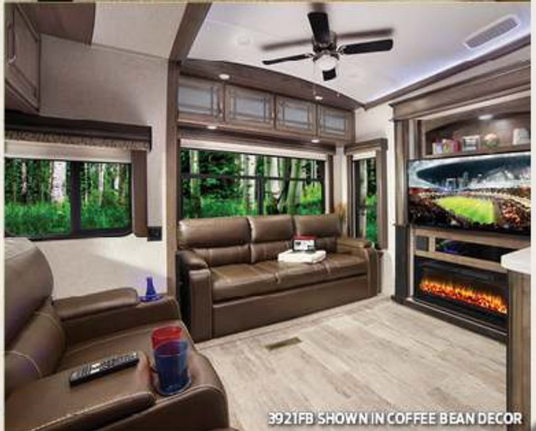
3921FB SHOWN IN COFFEE BEAN DECOR

Trust: state of being relied on. For over 19 years Montana has worked diligently to earn customers' trust. Through better design and better value, we continue to earn it!