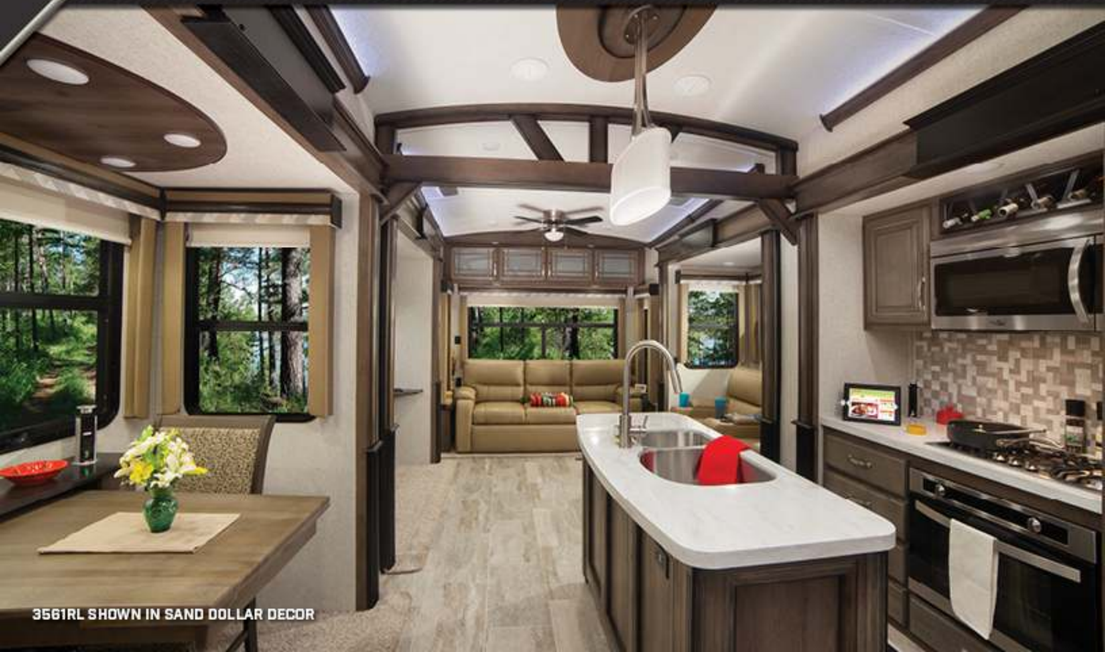
3561RL SHOWN IN SAND DOLLAR DECOR