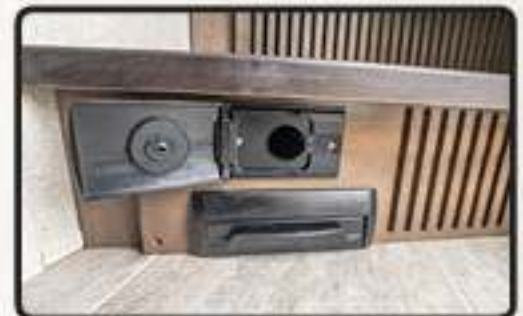
INDOOR/OUTDOOR CENTRAL VACUUM SYSTEM WITH HOSE AND ATTACHMENTS