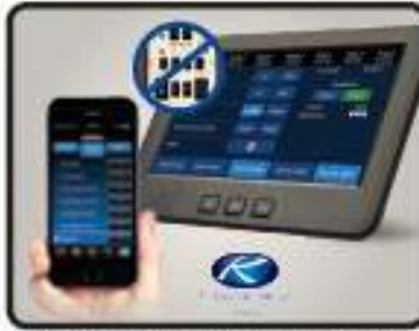
iN-COMMAND CONTROL SYSTEMS