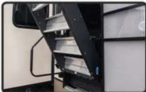
MOR RYDE STEP ABOVE WITH STRUT ASSIST GIVING YOU A ROCK-SOLID ENTRY