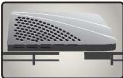
WIRED AND FRAMED FOR 3RD A/C JUST IN CASE IT'S NEEDED