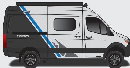
Aztec Partial Paint (Silver Van Only)