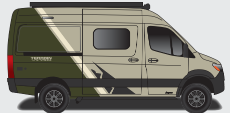
Forest Glade Partial Paint (Sandstone Van Only)